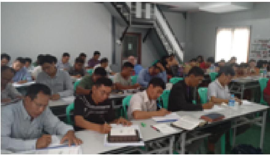
BEE Students at the training Center in Yangon